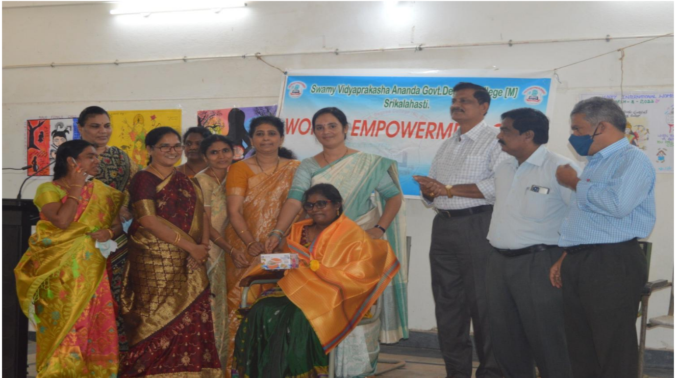
Principal presented mementos to the college teaching and non-teaching women staff