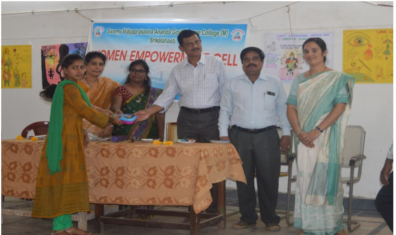
Prizes are offered to girl students based on their activities