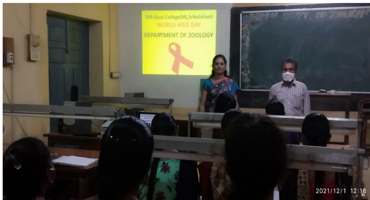
Photo copies of "AIDS awareness program" on 1-12-2021